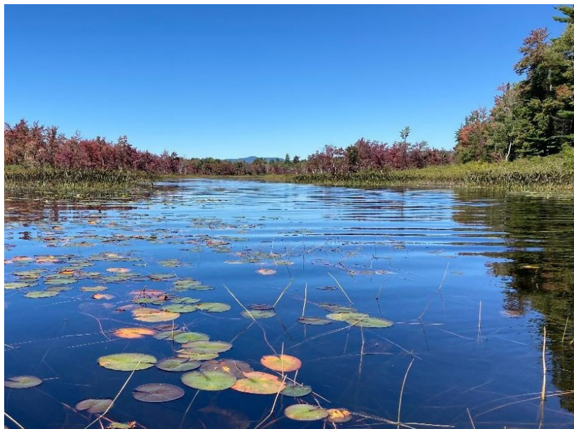
Sacandaga River above Route 8 Bridge

Lake Pleasant-Sacandaga Association PO Box 383 Wells NY 12190-0383