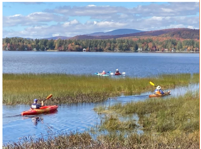
Kayaks at Cherry Brook

And: Launching, Mooring, Gas at Dock and Marine Supplies