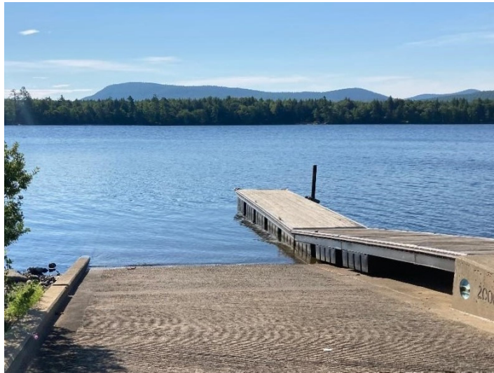
Moffitt Beach Boat Ramp

These AWI employees are only on site five days per week. This summer, the Town of Lake Pleasant and LPSA provided funding to hire additional part-time Lake Stewards to monitor the ramps at Moffitt Beach and the Speculator Pavilion two days per week, so these sites would be monitored seven days per week. Also, we placed a Lake Steward at Lake Pleasant Marine, to inspect boats there on weekends, when many visiting boaters launch at that ramp.